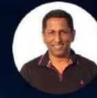
ALOK SHARMA Coca Cola