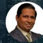
VS GIRISH ISCM